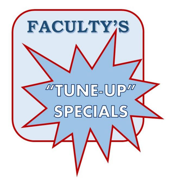
Submitted by Bettina Schramm Northern Lights Region 6 Faculty