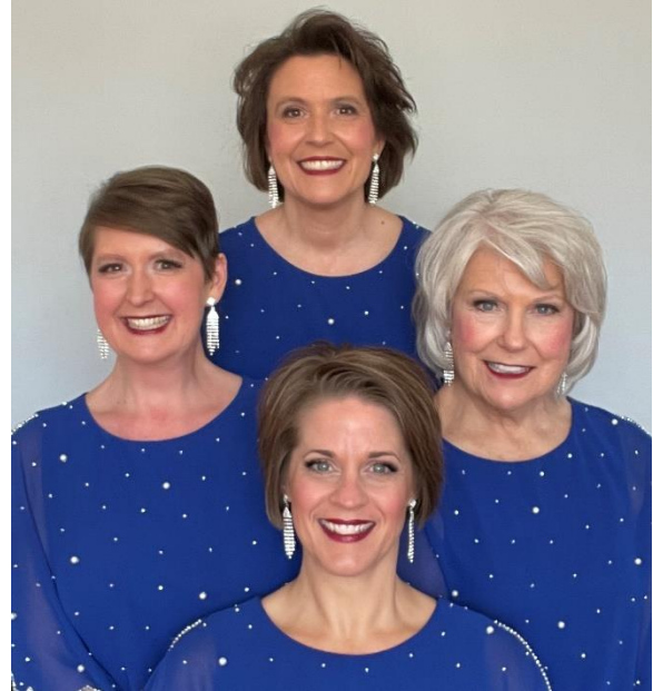
2022 Region 6 Quartet Champions - Spice Quartet