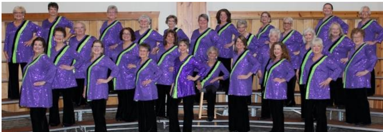
2022 Region 6 Chorus Champions - Spirit of Harmony Chorus