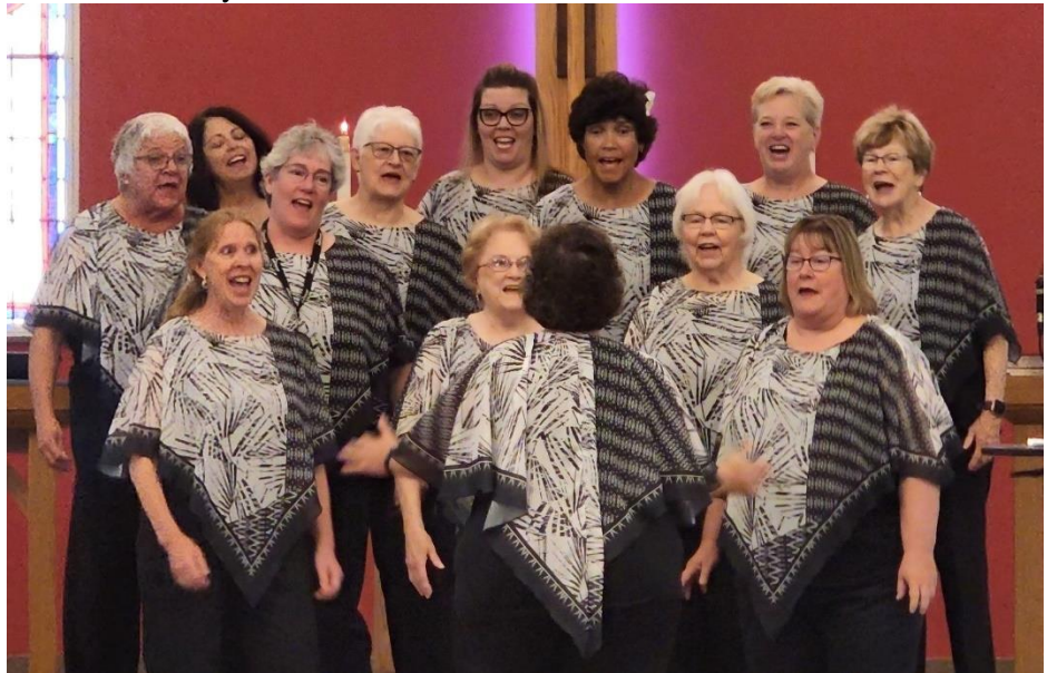
One of our many church singouts in 2022.

summer, and we all have enjoyed it each month. That is about it for MN Valley Chorus. We all wish our singing sister's a great end of the year push thru to next year!