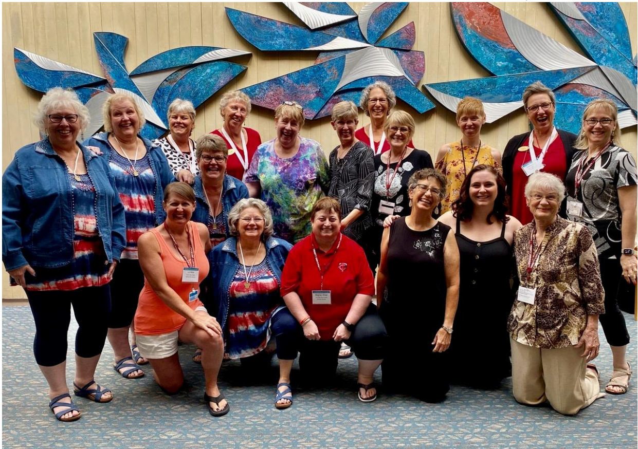
Region 6 IES attendees

All through this exciting summer, we felt the overwhelming love and support from our Sweet