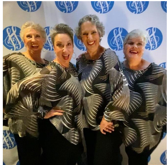
Right off the contest stage!

Boutilier. We performed in Edina with Side By Side, at Fort Snelling Chapel, at Como Park with City of Lakes and then the stamina testing trio of performances at Country Manor in St. Cloud the same day as a sendoff performance at City of Lakes.