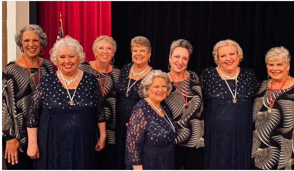
Upbeat and It’s About Time! Quartets