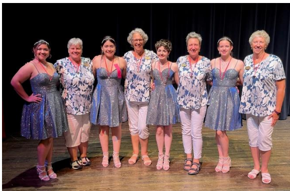
With Rising Star 2nd place medalists, IV (One V)

Then our own City of Lakes chorus offered scholarships to members wanting to attend IES which helped us solidify the decision. Texas here we come! There were flights to plan, a minivan and VRBO to rent, costumes to find, classes to register for, and of course music to sing.