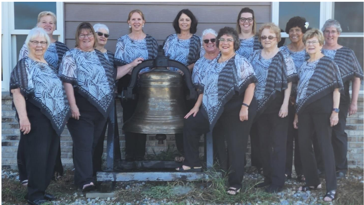
Waiting to sing at a church this summer, we gathered around the church's original bell from the 1800's.