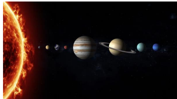
The music of the spheres