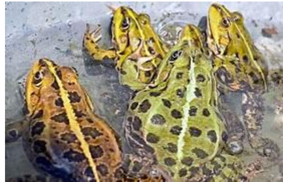
In Summer, all nature sings!