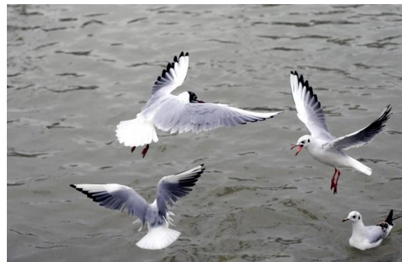
And round me rings